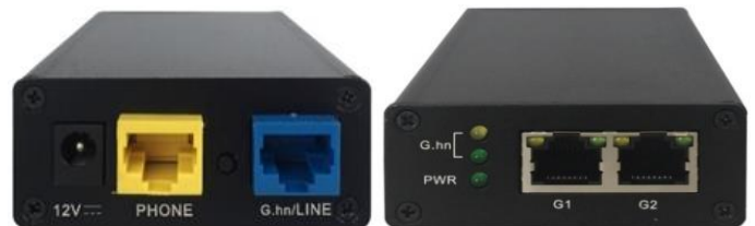
Panel and LED description